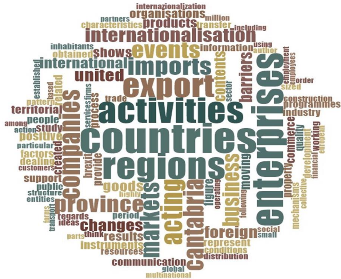
Figure 2 Word Cloud of Studies