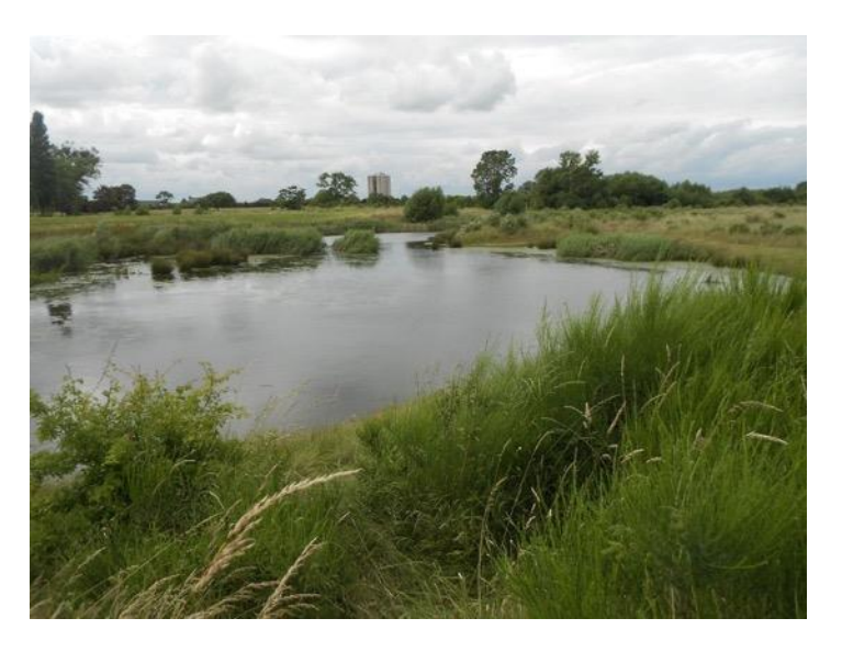
Credit - Dagenham: Beam Parklands <u>cc-by-sa/2.0</u> - © <u>Nigel Cox</u>