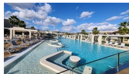
(Above) A snapshot of the Euphoria Hotel in Crete, where DETOCS project partners & stakeholders toured in October 2024 on study visit for excellence in sustainable tourism

2024, bringing together representatives from municipalities, hotel associations, chambers of commerce, hotel owners, and academic institutions. Discussions focused on regional energy challenges and three proposed good practices: an online platform for climate change monitoring, municipal support for local energy projects, and electric transport initiatives in Chania.