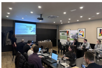
(Above) LEASP works with their regional stakeholder group to identify good practices for sustainable tourism in Slovenia

In Slovenia, DETOCS Lead Partner, Local Energy Agency Spodnje Podravje (LEASP) , has highlighted the “One-Stop-Shop (OSS)” for renewable energy as a DETOCS-endorsed best practice, showcasing how centralised support can accelerate renewable energy investments. Established to address administrative complexity and lack of clear information, the OSS streamlines processes for individuals, businesses, and municipalities. Managed by Borzen and supported by 36 advisory offices, the OSS provides free expert guidance, reducing bureaucracy and boosting investor confidence. In its first phase, it aims to deliver 1,400 advisory sessions, with 60% of advised investors expected to proceed with projects.