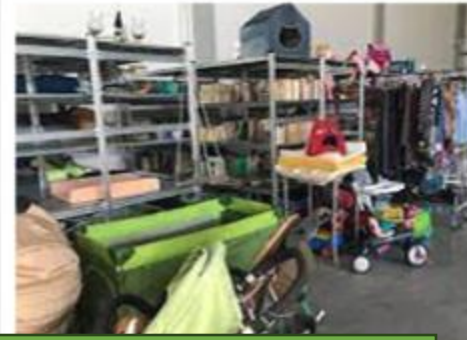
FREE REUSE SPOT