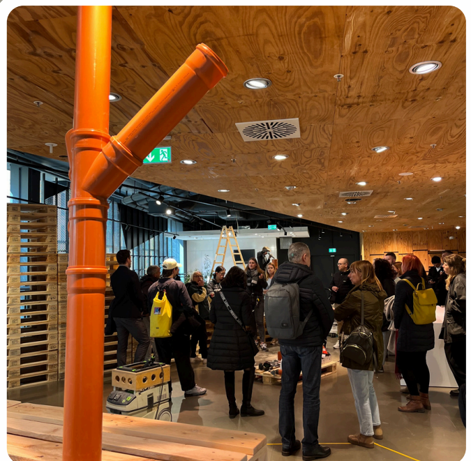
Partners at the Concept Store "Wiederschön" during study visit