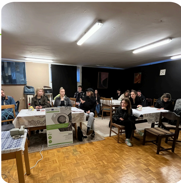
Participants of the meeting at the Faculty of Social Sciences in Ljubljana