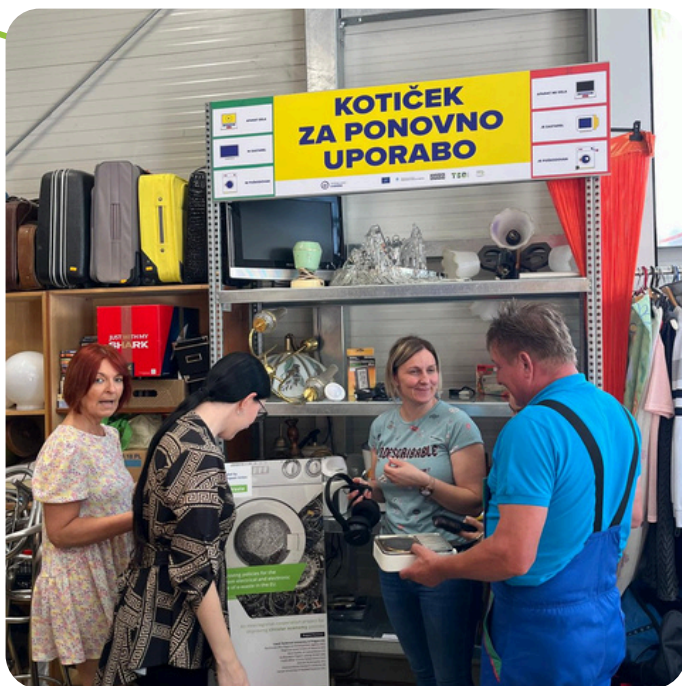
Reuse corner at the Reuse Centre in Rogaška Slatina

Conversations revolved around the increasing volume of e-waste, attributed to factors such as the introduction of new device models, the rise of online shopping, shorter device lifespan, and expensive repair services. Additionally, participants explored potential solutions, including the importance of manufacturers producing products that are more recyclable and utilizing eco-friendly materials.