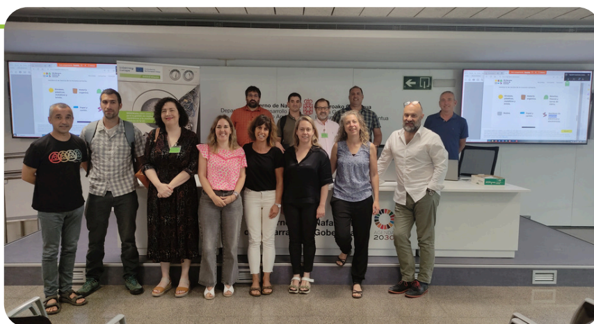
Participants of the 3rd Local Stakeholder Seminar in Navarra

Following this, the seminar highlighted the results of a study presented at the previous meeting by the Technology Centre Lurederra, focusing on the potential implementation of new business models in regions concerning e-waste and critical raw materials. The session proceeded with the presentation of best practices gathered by other project partners, prompting a discussion among attendees on potential replication in Navarra. Finally, plans for the upcoming Interregional Event on October 16-17, 2024, in Navarra were outlined, with new ideas proposed for inclusion in the study visits for project partners.