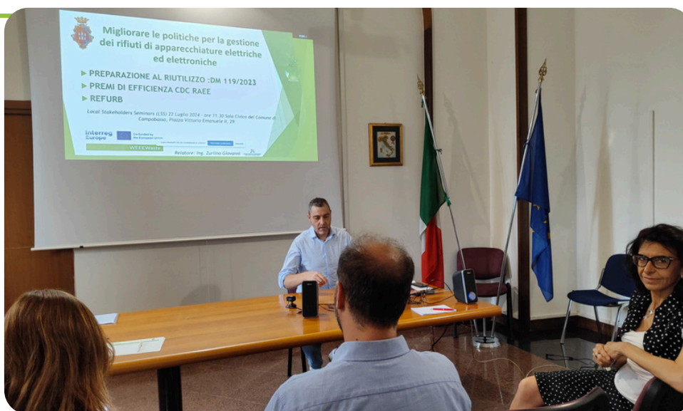
3rd Local Stakeholder Seminar of the Municipality of Campobasso

We extend our gratitude to all stakeholders for their active engagement and keen interest. Moving forward, we are committed to collaborating further to enhance WEEE management practices and foster a more sustainable future for everyone involved.