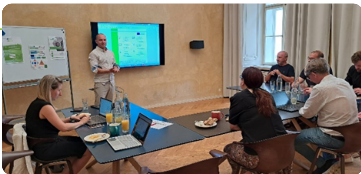
Participants of the 3rd Local Stakeholder Seminar of the Czech Republic

The major part of the meeting was designated to discussion about current status and barriers on the market. Participants discussed barriers in the Czech Republic region in the field of e-waste and tried to find the best way how to promote and unify the awareness campaign 'How to increase the motivation of citizens to collect e-waste for recycling?' in the Czech Republic.