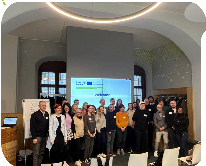
Project consortium during the interregional event in Leipzig