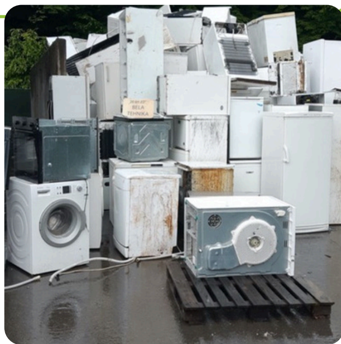
E-waste collection at OKP Rogaška Slatina