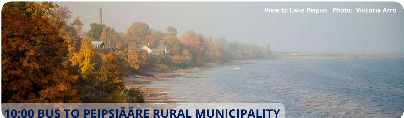
View to Lake Peipus.