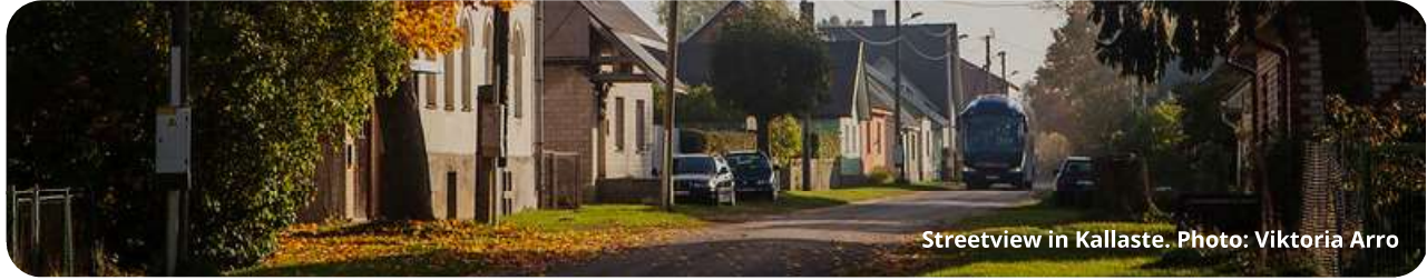
Streetview in Kallaste.