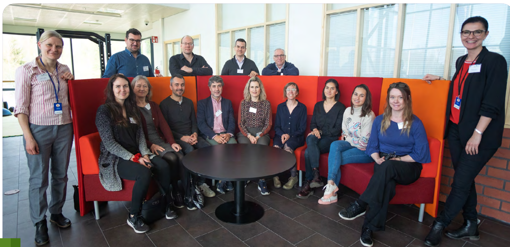
Project partners and stakeholders at the Kick-off meeting.

Enhancing stakeholder cooperation in supporting communities to develop biobased circular economy