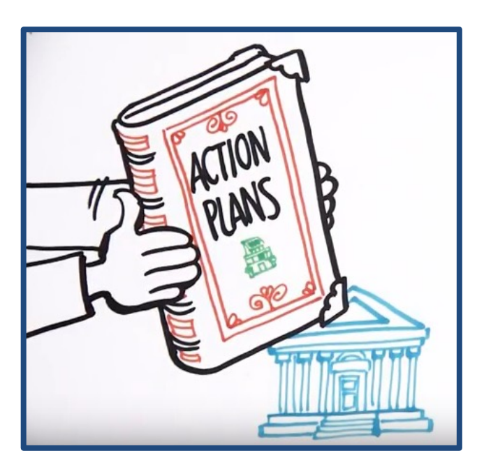
Only 2 actions in the AP!