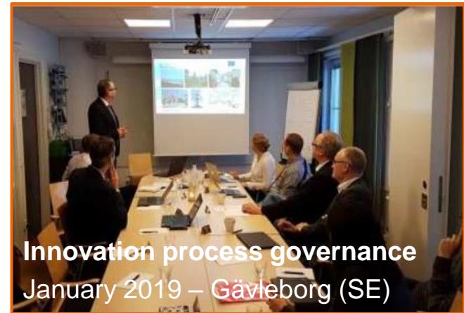
Innovation process governance January 2019 – Gävleborg (SE)

https://www.interregeurope.eu/peer-review/