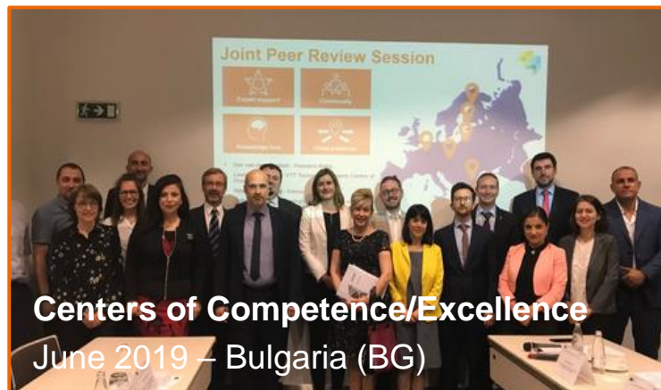
Centers of Competence/Excellence June 2019 – Bulgaria (BG)