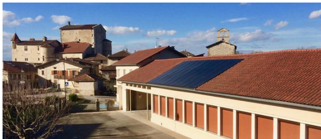
Centrales villageoises Portes du Vercors

adil - LA DRÔME - information énergie alec agence locale de l'énergie et du climat Métropole de Lyon