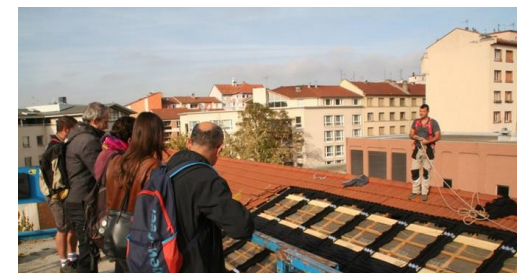
Toits en transition