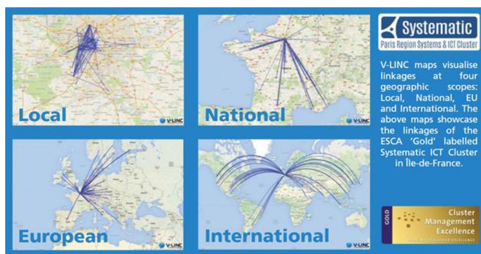
Figure 2. Mapping Systematic ICT Cluster's linkages.

In ECORIS3 , V-LINC is a tool developed by researchers at the School of Business at the Cork Institute of Technology to map, visualise, and analyse relational data within cluster ecosystems . Based on Social Network Analysis (SNA), V-LINC can inform on the most important actors and projects within a cluster. Social Network Analysis (SNA) based on primary data that are collected through face-to-face interviews are time-consuming thus secondary data are to be preferred. SNA and tools such as V-LINC can offer an evidence-based approach and policy insights for regional policymakers to design and implement better regional innovation policies.