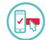
Online Booking & e-ticketing