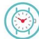
Staggered Film Times