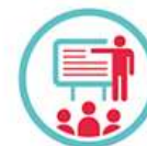
Staff Training & PPE