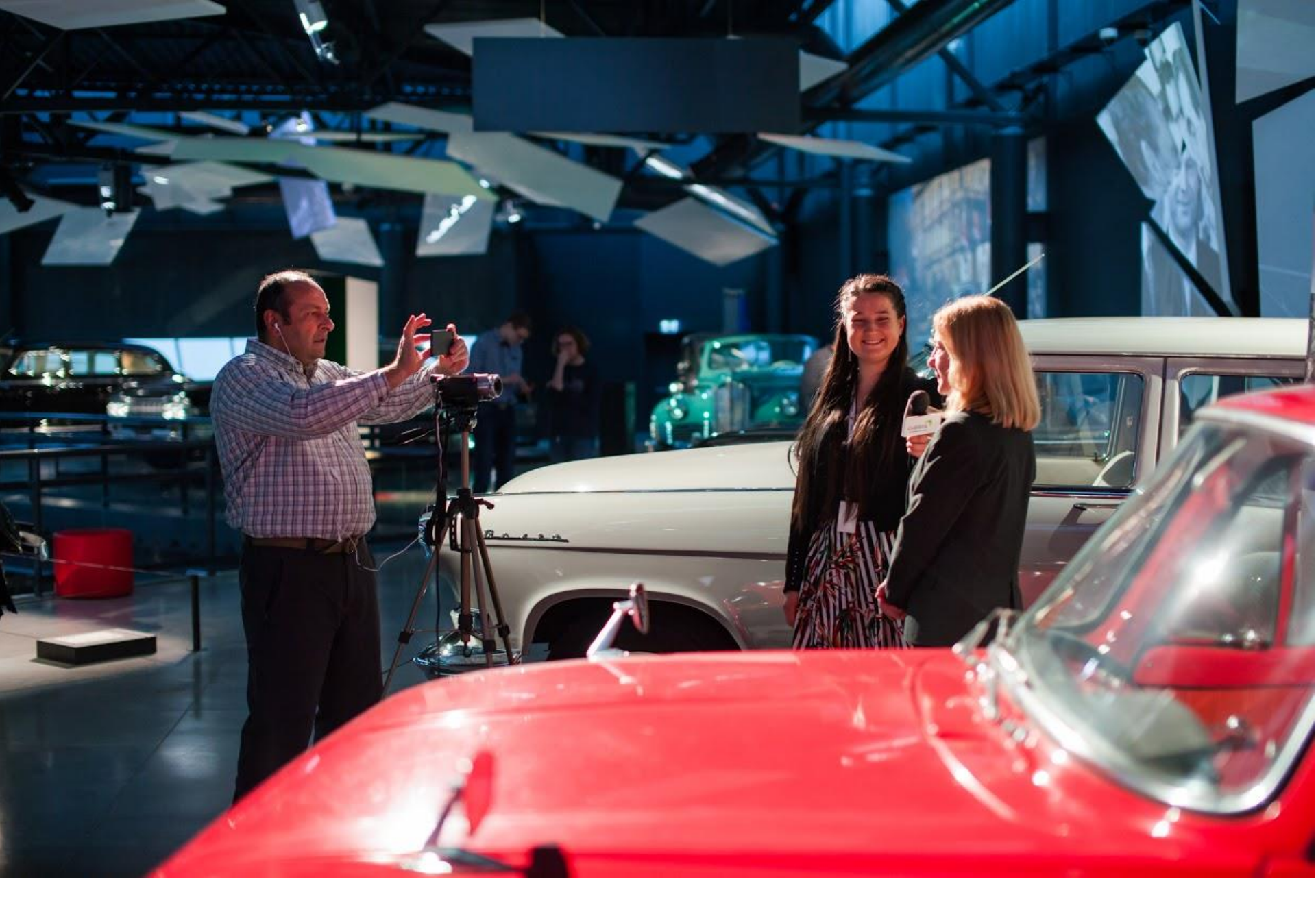
20 March, 2018 4th Interregional Thematic Workshop: Innovation and Digitisation in Riga, Latvia