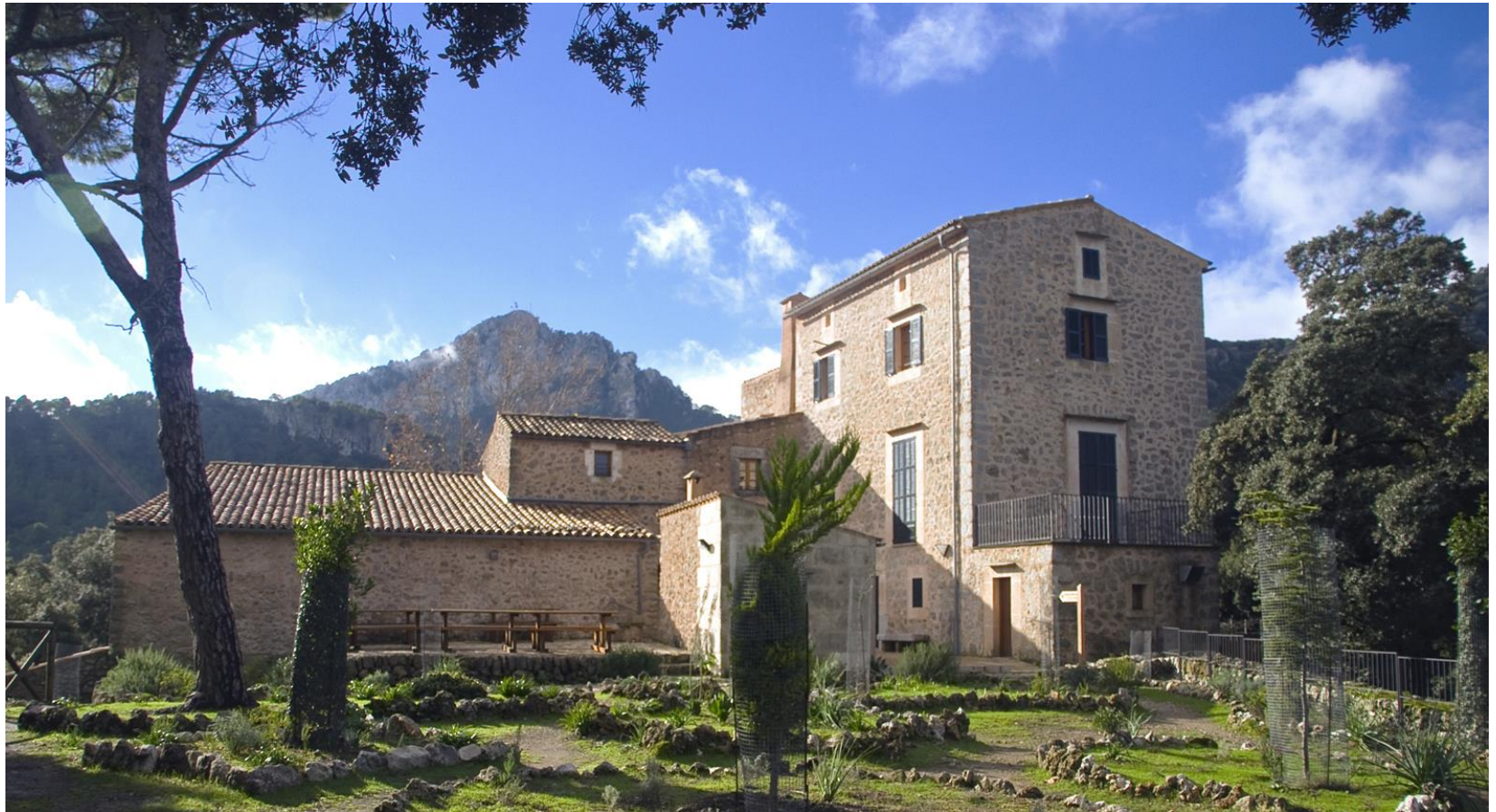
SON AMER Refuge - 2004 (52 beds)