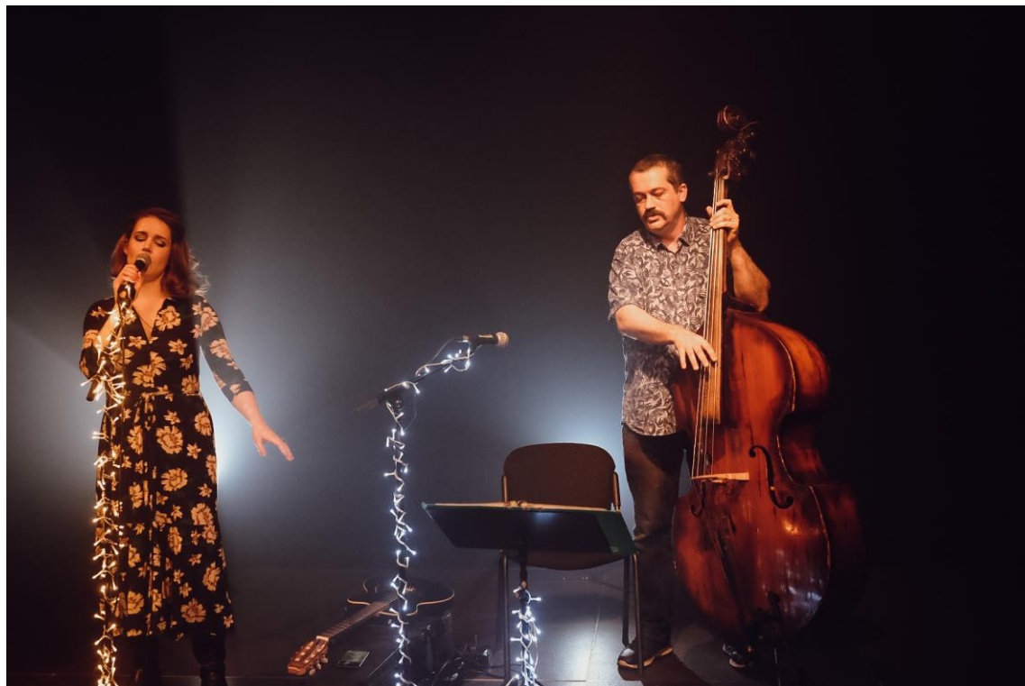
Pliš, Pre-Christmas Concert, 2020 (live stream)