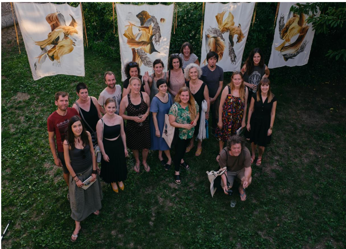
Opening of KAOS Festival of Contemporary Collage, 2019