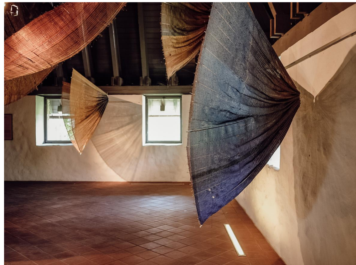
Exhibition Programme of BIEN 2021, Textile Art Biennial