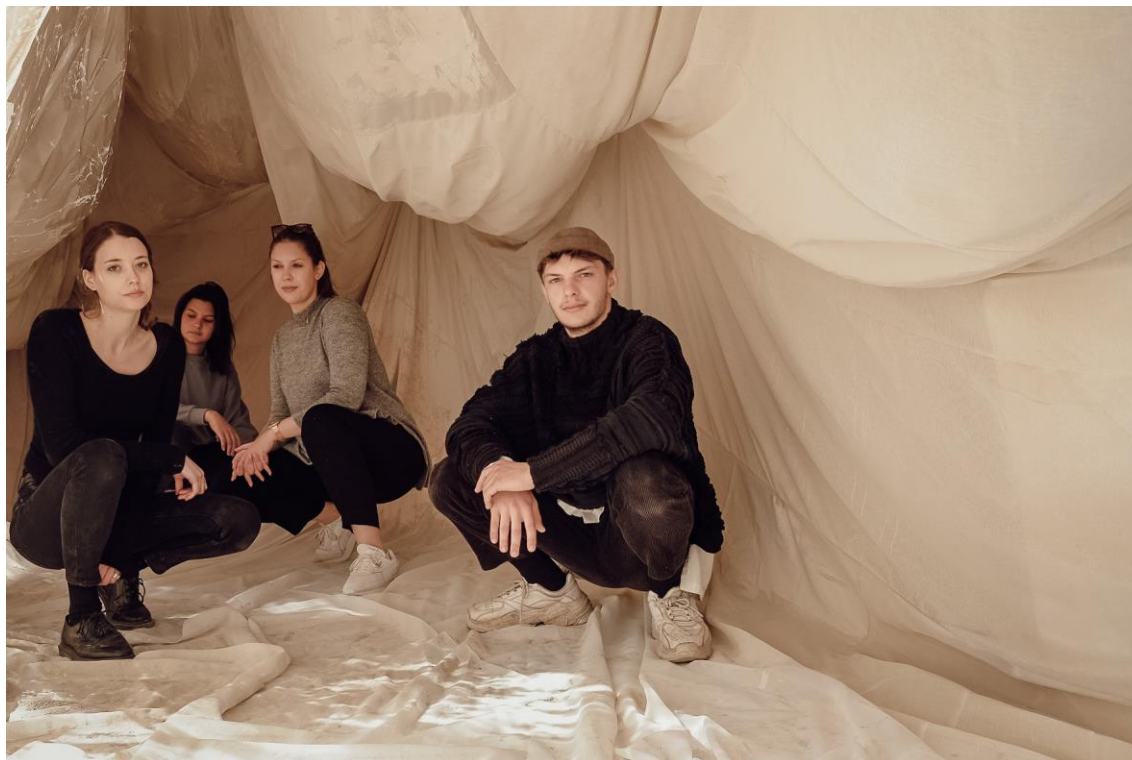
CAVE_ME, artist-in-residency programme, nr kvadrat x BIEN 2021