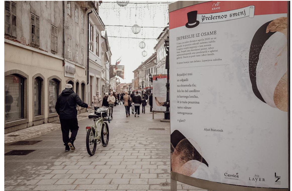
Impresije iz osame / Impressions from isolation, 2021