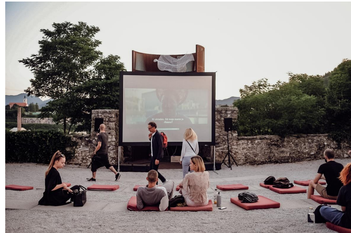
Films on Vovk Garden, summer 2021 (in cooperation with ZTKK)