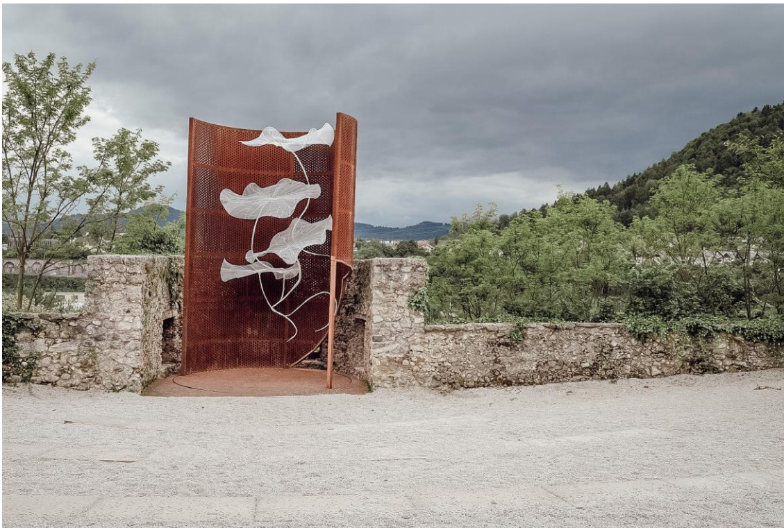
BIEN 2021, Textile Art Biennial