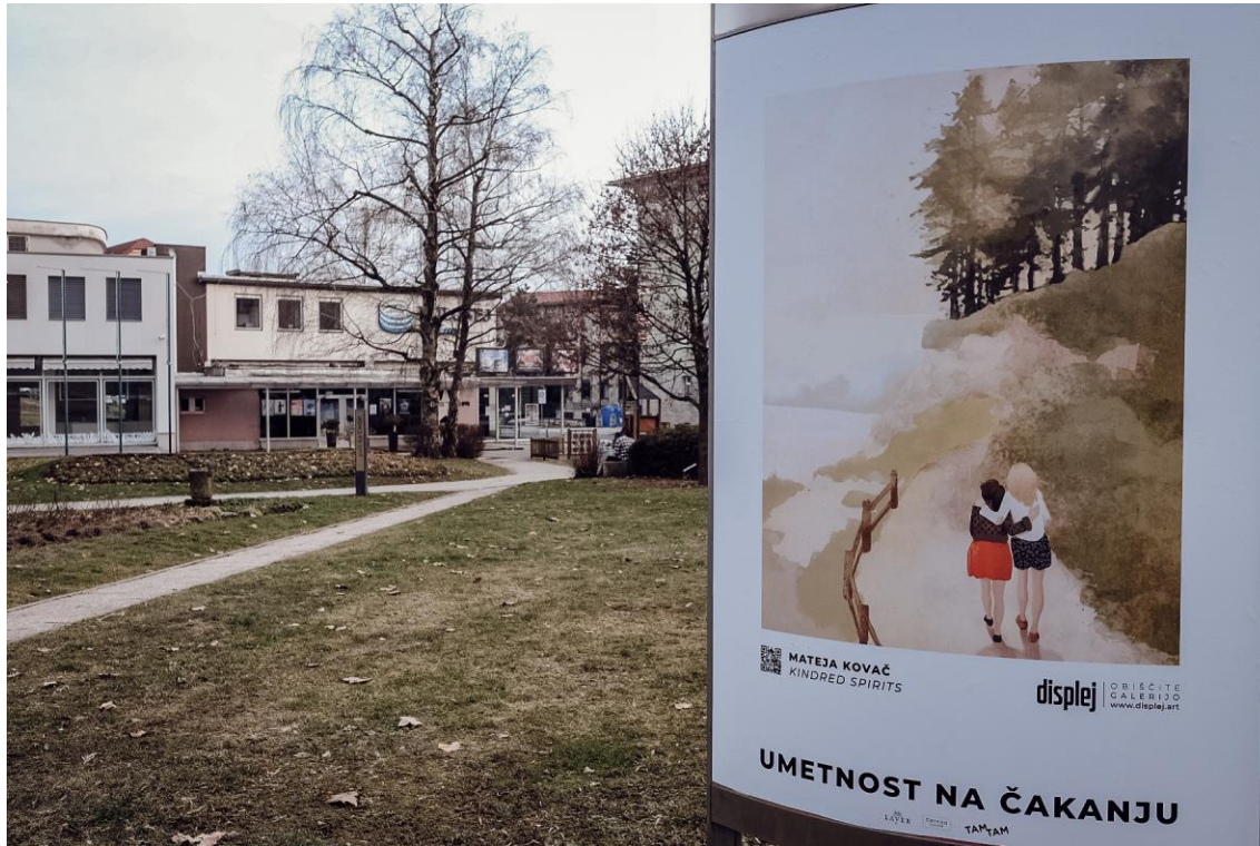
Umetnost na čakanju / Art on Hold project, 2020 and 2021