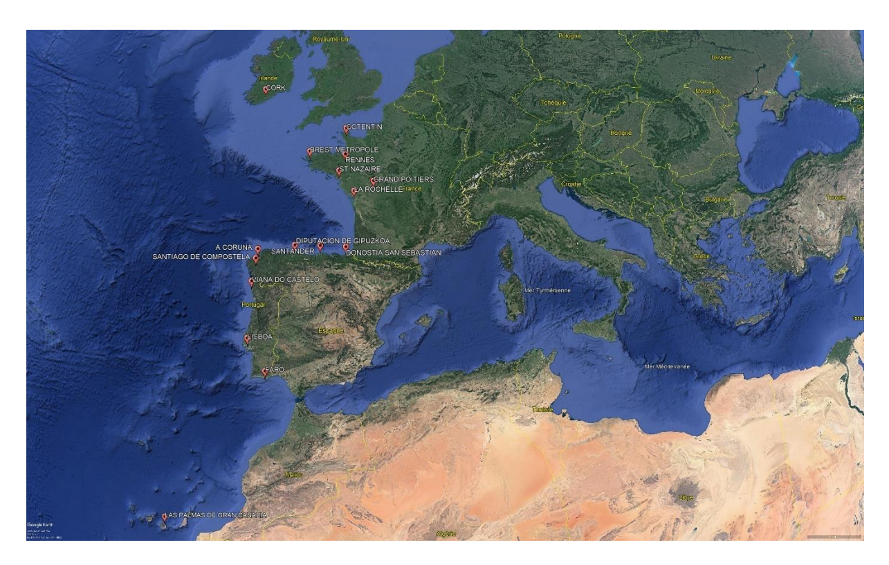
Figure 1. Members of the Atlantic Cities.

Another activity of the European network Atlantic Cities is the promotion of dynamic and direct relations between cities through cooperation with other networks.