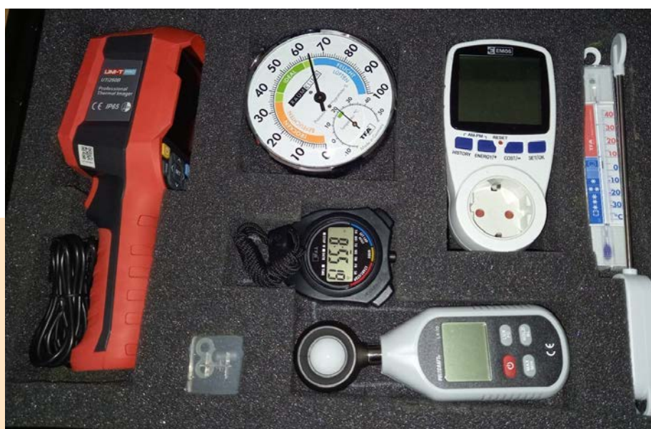
Carbon reduction suitcase for Citizens to detect losses and irregularities in their homes

In the RAP (Regional Action Plan), Energap focused on Working field 5 - Informed and active citizens -community. Through the activities in the RAP, they defined the methods and tools for active engagement of different target groups of citizens in planning and implementing the actions. The solutions will include ICT technologies and instruments as well as some basic face to face measures, for citizen to challenge the engagement.