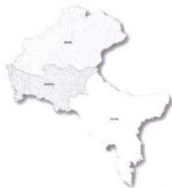
Position of Northern Primorska (Goriška) development region in Slovenia

The ageing trend of the population in the last ten years shows that in 2050 more than 30 % of the population in the region will be aged 65+, while in the Soča Valley this number will grow up to 40 %.