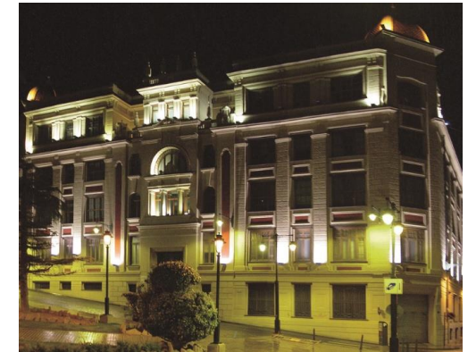
AITEX's headquarters in Alcoi (Alicante, Spain)