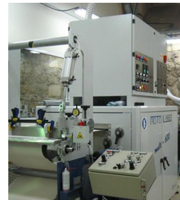
AIR KNIFE COATING