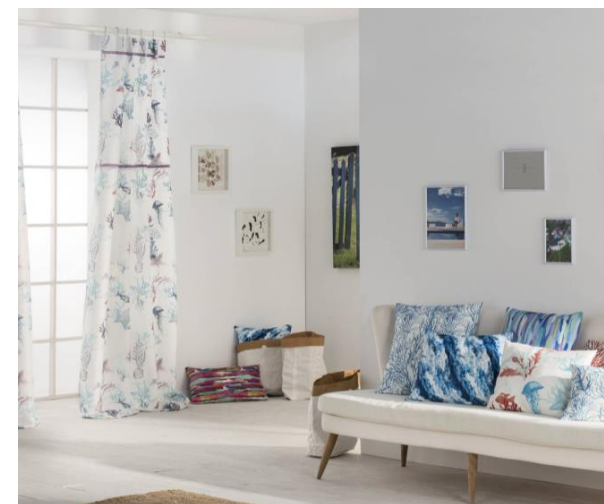
‘Acuario1’ collection (last R&D project from Ind. Bitex): digitally printed textiles coming from recycled raw materials, providing 99% of antiviral activity against FCov coronavirus (ISO 18184:2019).