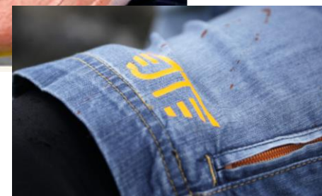
End products from JEANSTRACK project, denim-like garments for outdoor sport/activities.