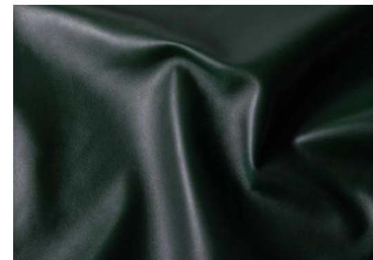
Leather manufactured by Inpelsa.