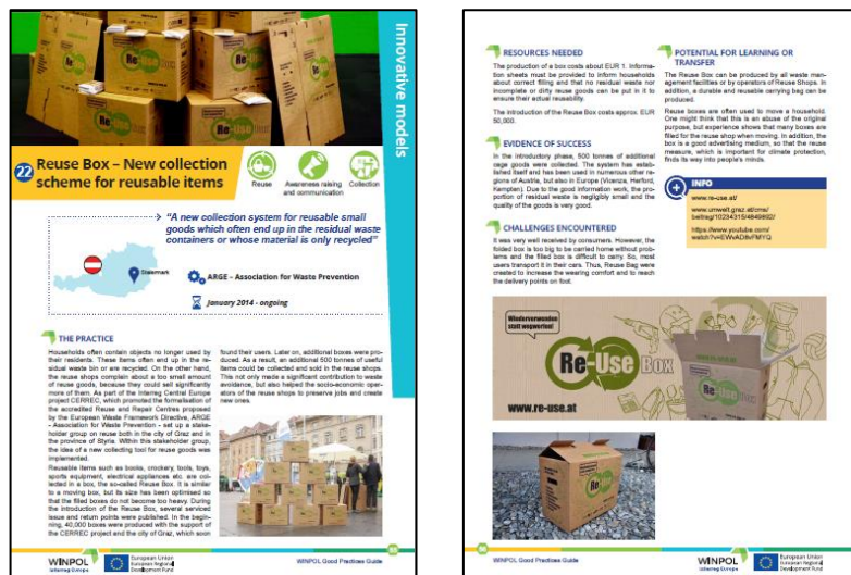
Example of Good Practice

Following the start of the second phase this December, project partners will have two years, until November 2022, to implement these actions to concretely improve their performances regarding waste management and sustainability.