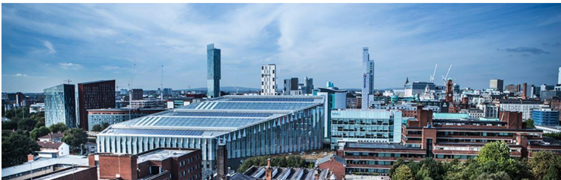
Recovery and district centres

On 9 July 2020, ABCitiEs and the Institute for Place Management co-hosted a webinar on the effects of Covid-19 on the ABCitiEs partner regions and how municipalities and entrepreneurs have responded and reacted differently to the pandemic. The webinar was viewed by 75 people – including people audience members from Spain, Austria and Columbia. Interested to learn more about local solutions to combat new COVID-19 outbreaks?