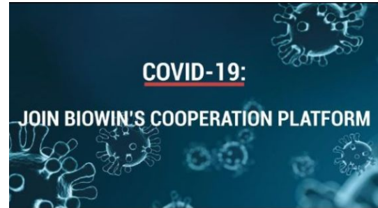
BioWin Tackling COVID-19

Rubedo Sistemas, a Kaunas-based Lithuanian robotics firm is developing a disinfectant-spraying robot that could help limit the spread of Covid-19. The prototype is to be tested in Hong Kong at present. Read more: