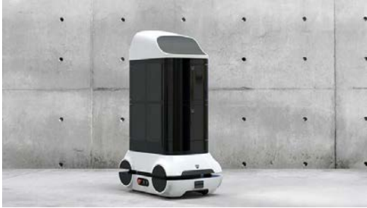
Robots fighting COVID-19

Rubedo Sistemas, a Kaunas-based Lithuanian robotics firm is developing a disinfectant-spraying robot that could help limit the spread of Covid-19. The prototype is to be tested in Hong Kong at present. Read more: