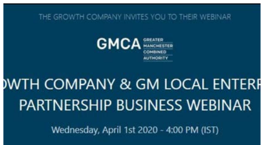
COVID-19 Supports Manchester

The Manchester Growth Company have produced a simple webinar to explain the range of support measures on offer to businesses and the self-employed during the COVID19 crisis. Read more: