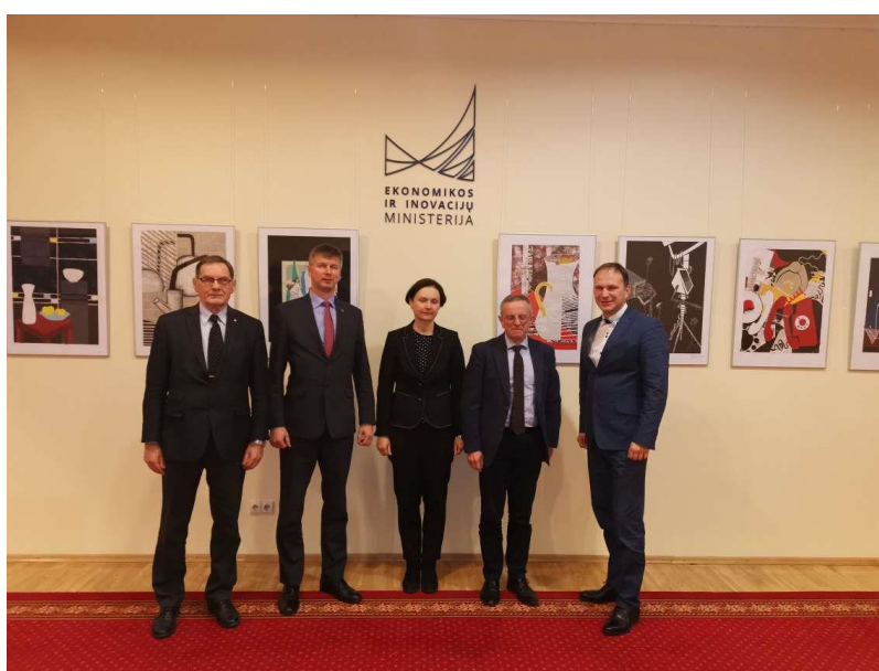
Ministry of Economy and Innovation, Vilnius, 25 th of November

At the end of the meeting all attendees were informed about the next steps in the project Action Plan finalization and future endorsement, after final JS review. Kaunas STP has warmly invited all participants to participate in Final FFWD Europe conference: "Global Startup Ecosystem: Collaborate or Compete?" on the 5 th of December in Kaunas.