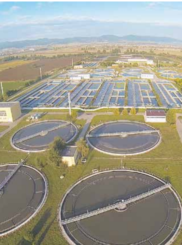
General Layout of the plant With its environmental performance Sofia WWTP is paving the way for Sofia water cycle to be among the first fully energy neutral water cycles in the world.

The STAR lite optimization system is operating in Kubratovo WWTP since the beginning of 2013. The control modules included are regulation of dissolved oxygen, return sludge, metal dosing, recirculation, flow distribution and sludge age.