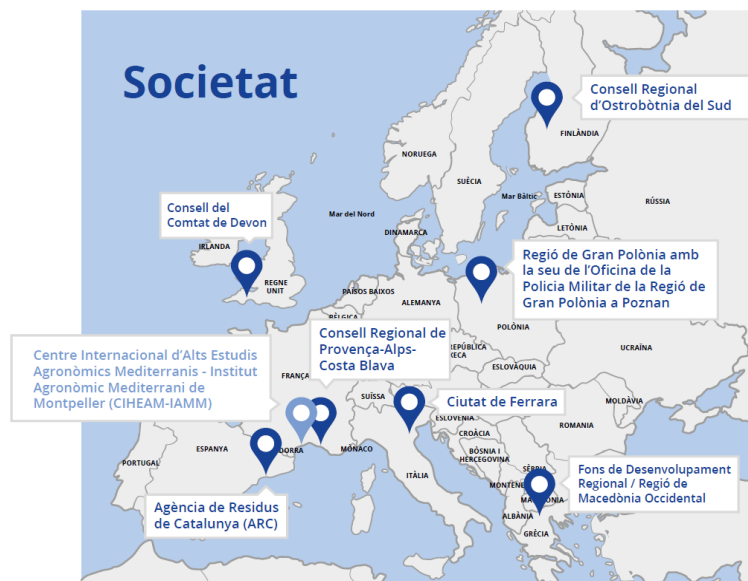
Figure 1: Members of the Interreg Europe Ecowaste4food project

Catalonia is one of the seven member regions of the Ecowaste4food project. The Waste Agency of Catalonia has coordinated the European project within its territory with the aim of initiating a participative action plan in conjunction with all the different regional and local stakeholders of the food chain.