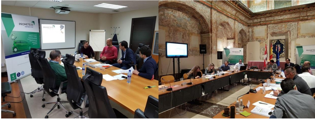
Figure 1: Two snapshots of the Focused Meeting and the Steering Committee held by the Prometeus partnership in Valladolid, Spain – April 10-11 th 2018: the presentation and sharing of Good Practices were two of the main issues covered by the partnership