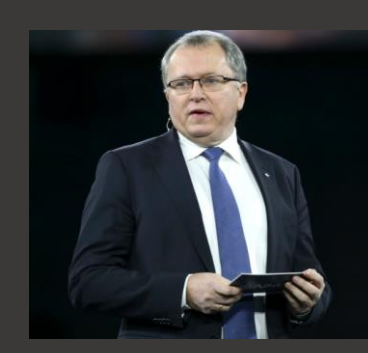
Statoil-sjef Eldar Sætre