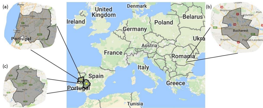
Centro Region; (b) Bucharest - Ilfov; (c) Extremadura (Google Maps, 2017)