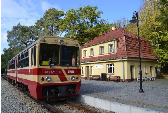
Figure 1: Rewal-Pogorzelica narrow-gauge railway

plans must be completed and ready for implementation. So there is only one thing left to say: let's travel the last mile together!