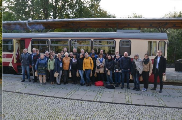
Figure 2: Partners and stakeholders during the study visit