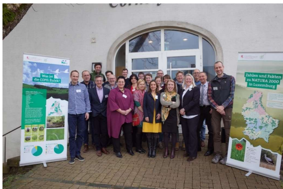
Fig. 2: The Peer Review participants