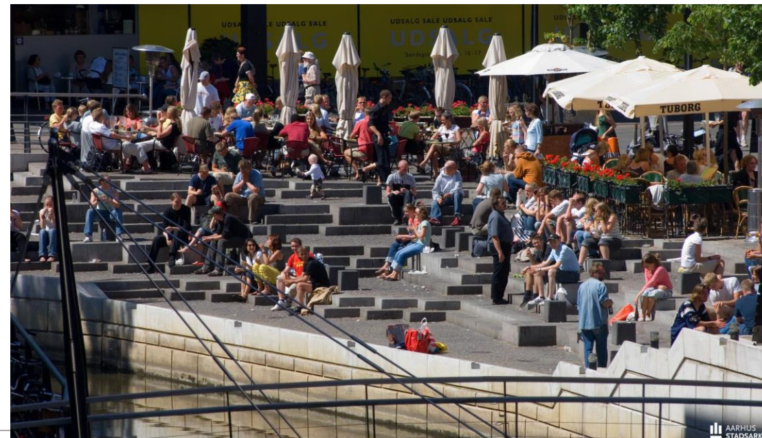
People hanging out at “The Spanish Steps”. 2005.