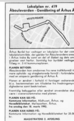
Advertisement on the district development plan (local plan in Danish) on The Uncovering of The River Aarhus. Aarhus Stiftstidende, 17-03-1992.