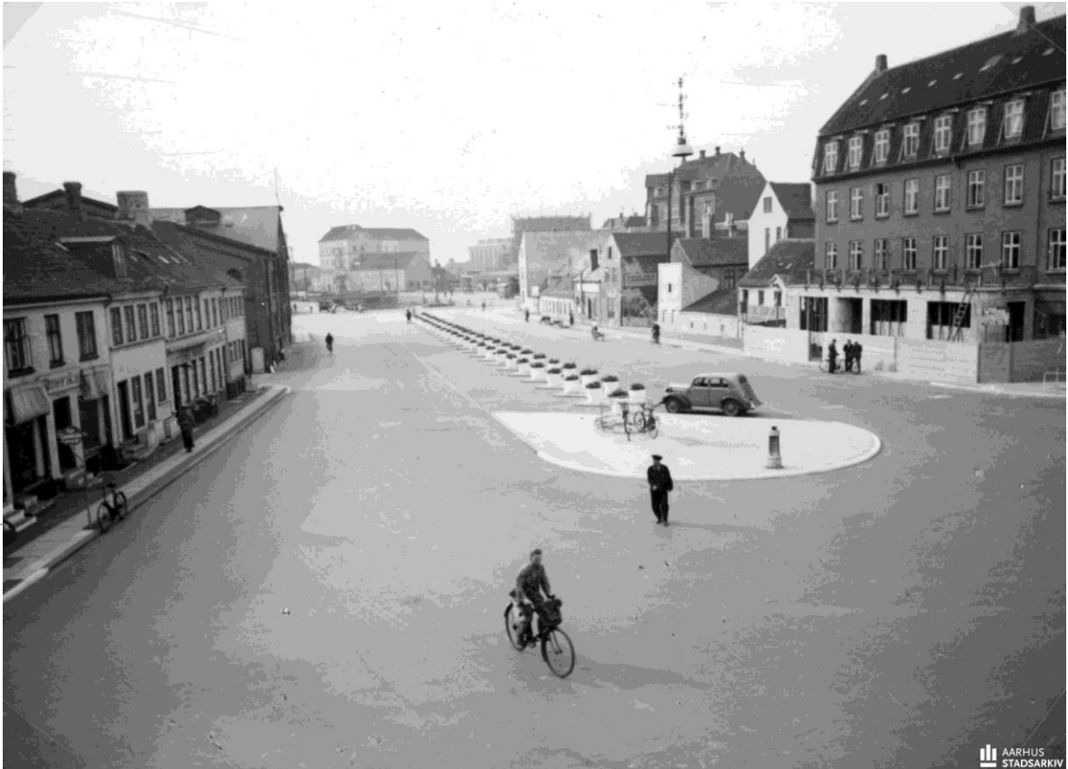
After covering up parts of The River Aarhus, ca. 1939: https://www.aarhusarkivet.dk/records/000319666