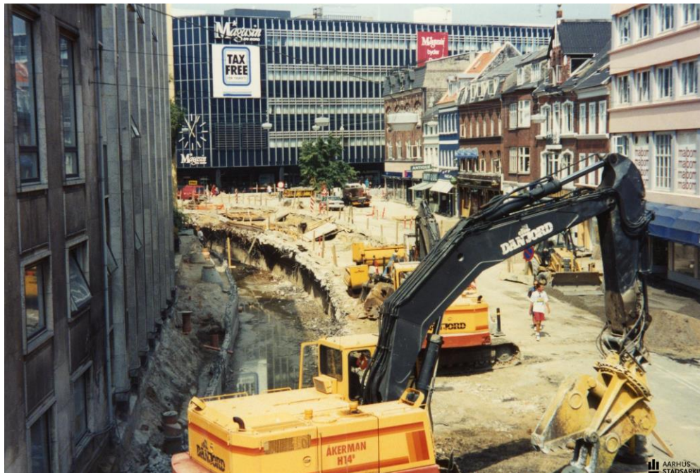
First stage. Uncovering The River Aarhus. 1995.