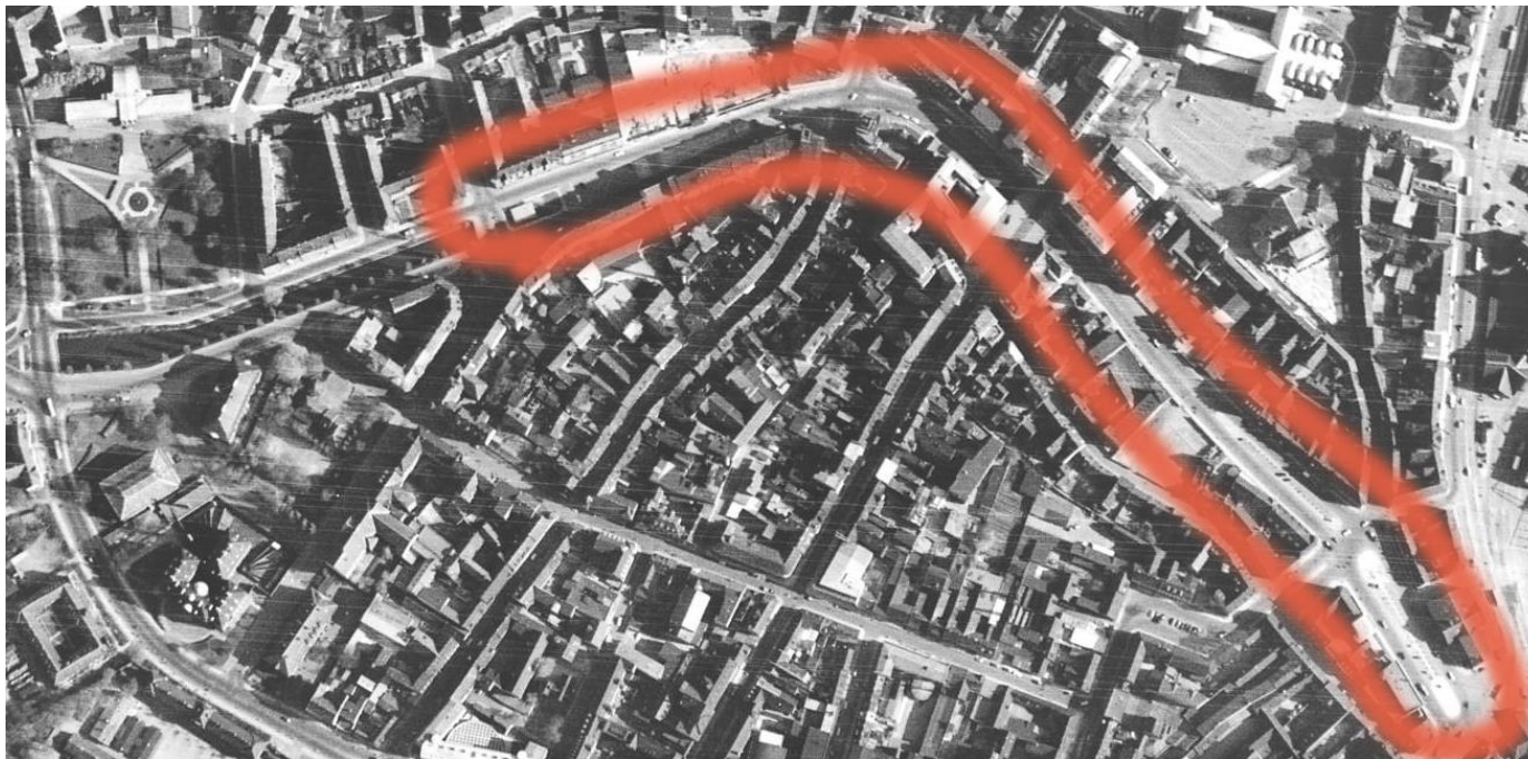
Ref: Krak.dk (1954 map)