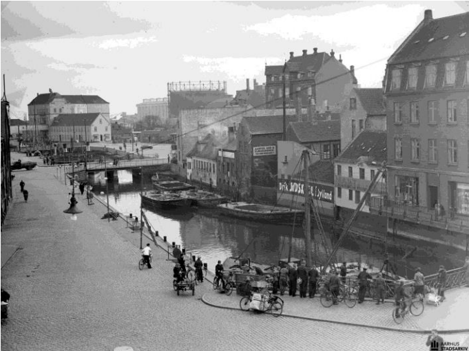
Before the uncovering of The River Aarhus, ca. 1930s: https://www.aarhusarkivet.dk/records/000319665