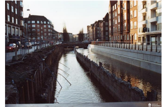
Work on Phase 2.