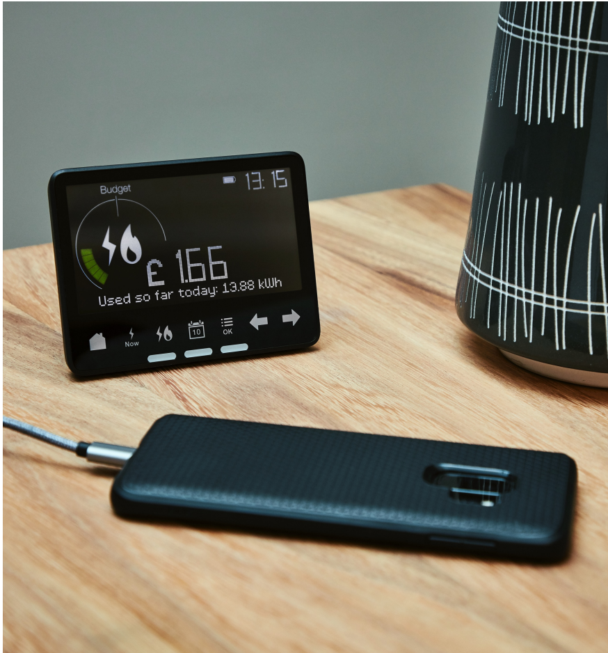
Smart Energy GB