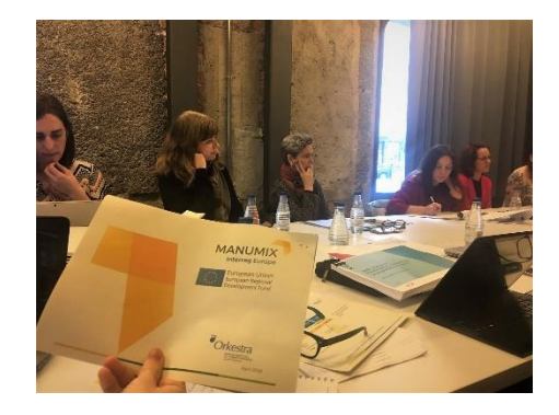
3 peer reviews Basque Country, Lithuania & Wales