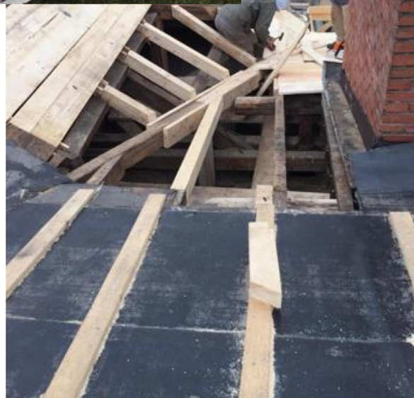
After the intervention March 2021