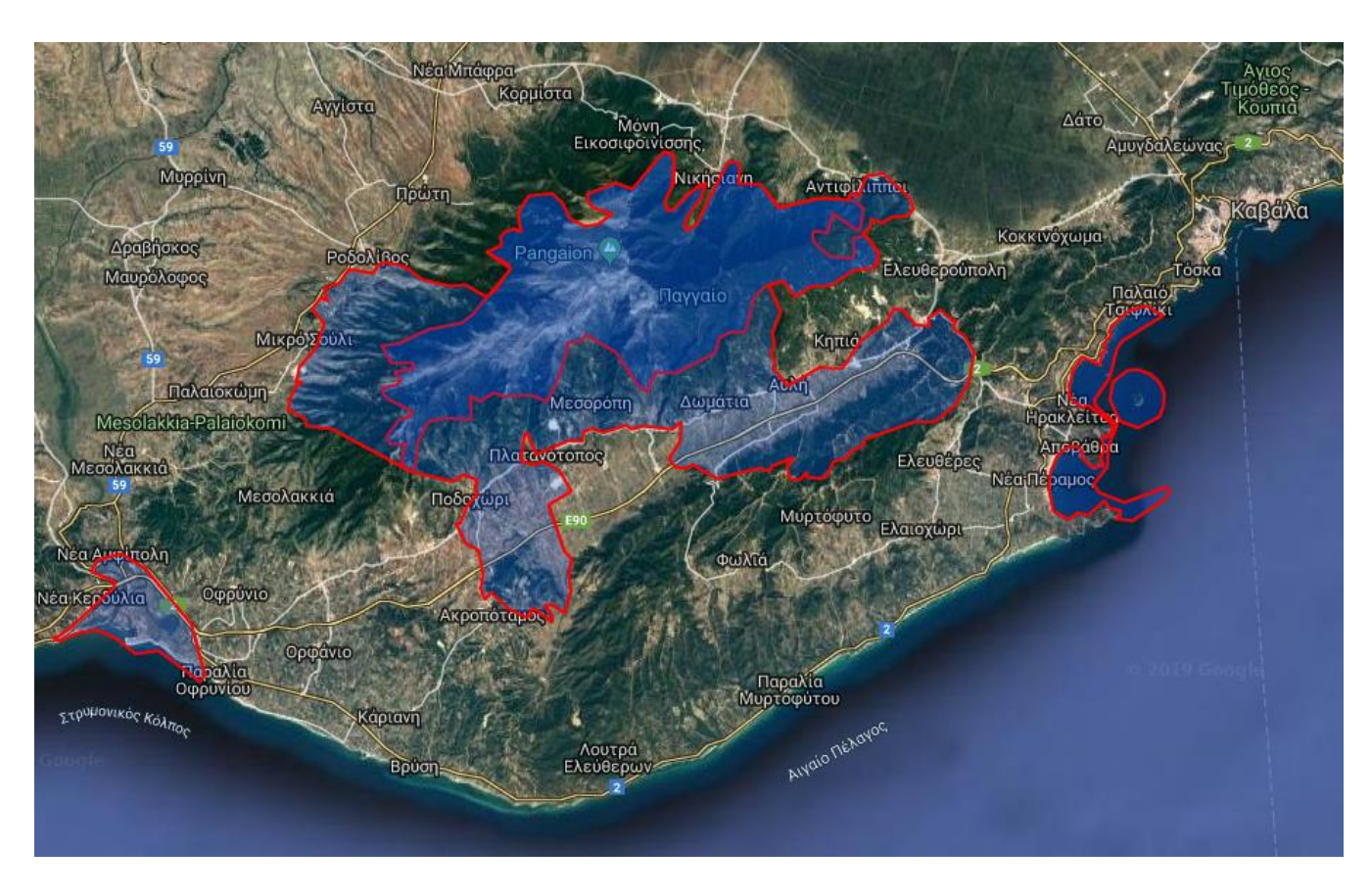
Figure 2 Natura 2000 sites in the Municipality of Paggaio (GEOGREECE, 2019)