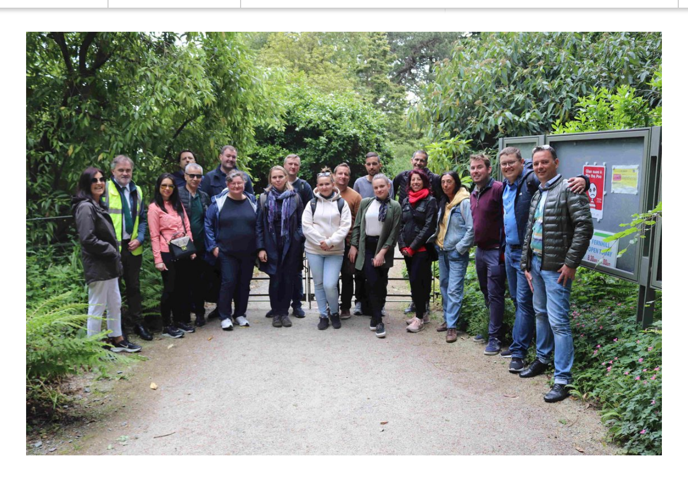
PROGRESS partners at Fernhill Park and Gardens (Ireland) with local stakeholders. June 2022.

The second day of the meeting was dedicated to visiting some of the peri-urban and natural areas of Dún Laoghaire-Rathdown County Council and specifically, some of the sites mapped for the Pilot Action mentioned above. The first stop was at Fernhill Park and Gardens, where the tour focused on the nature-centered approach to the design and management of the park for biodiversity, species protection and nature conservation.