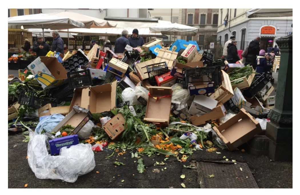
Example of incorrect waste management at a local market

the production of such waste, but also the costs to the community for their collection and start to recovery or disposal. These reasons demonstrate that a higher policy commitment is necessary, such as providing baselines and criteria to regulate the markets in accordance with the Circular Economy principles. Farmers market in particular represent a privileged place to test the initiative, which in the future could be extended to other events.