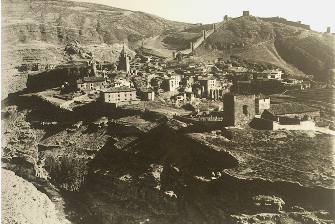
Figure 1. Image of the walled enclosure of Albarracín in 1952, before the first restoration works. Photograph from the archive of Francisco López Segura. Institute of Teruel Studies. Reg. No. 157.