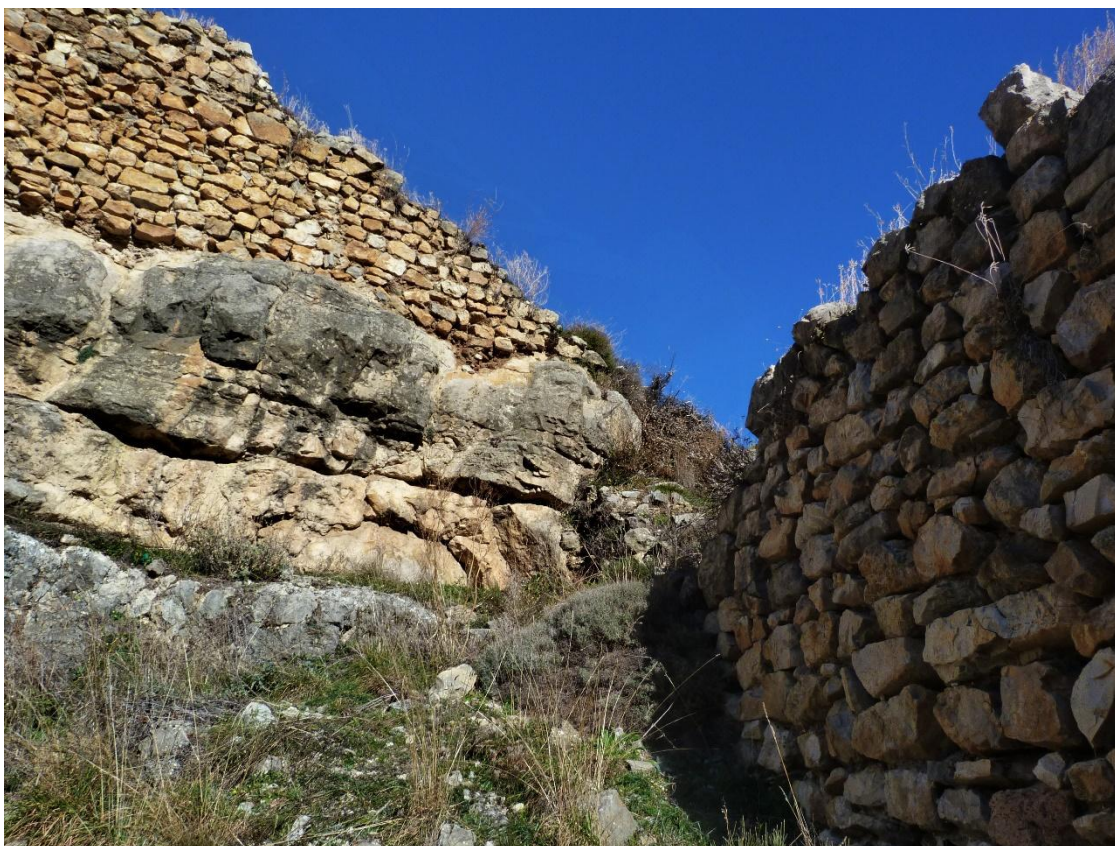
Figure 7. Extrados of the south wall in 2019