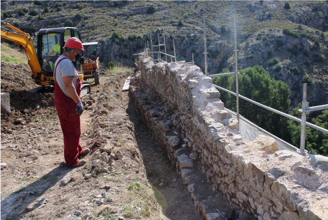
Figure 9. Excavation of the intrados of the wall section intervened in the second phase (2021)