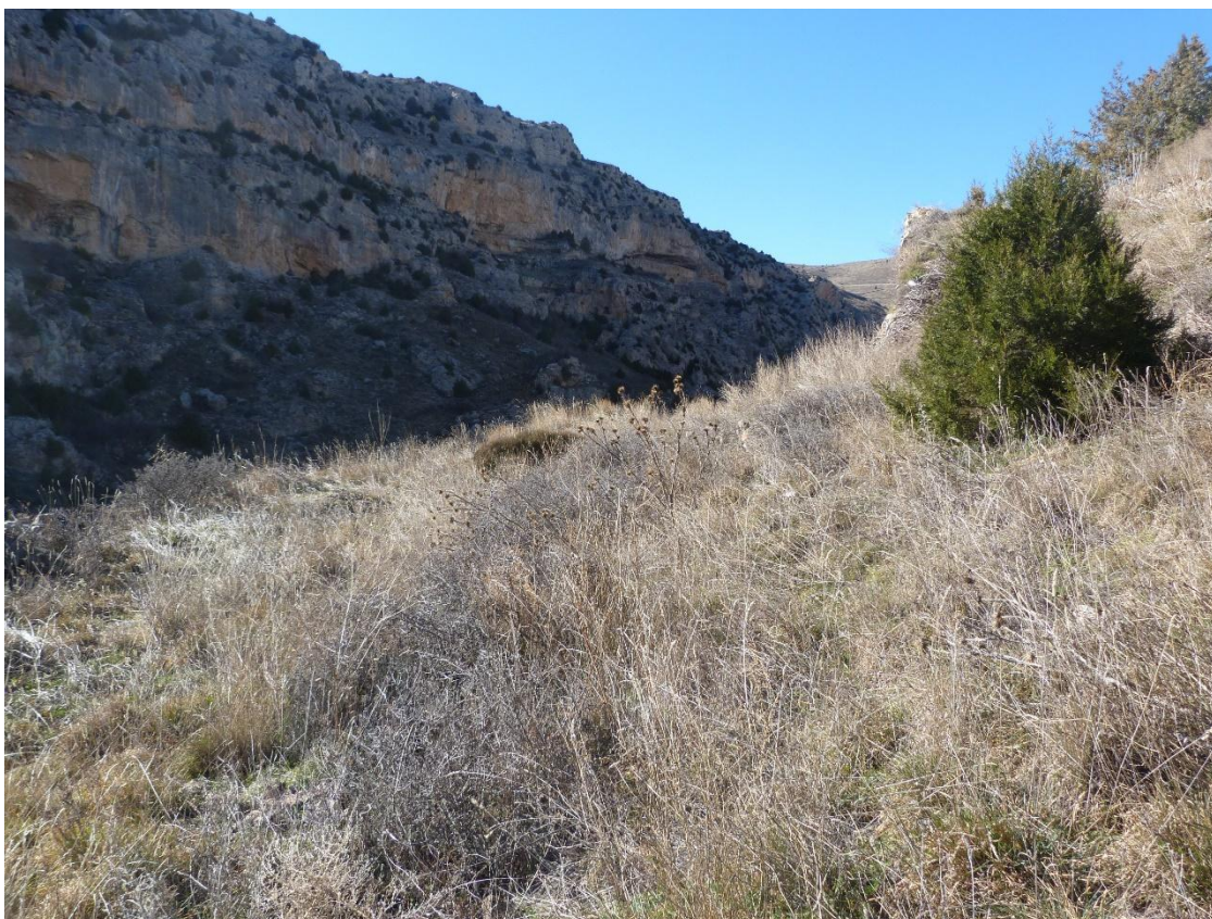
Figure 5. Intrados of the south wall in 2019, completely amortized by the land