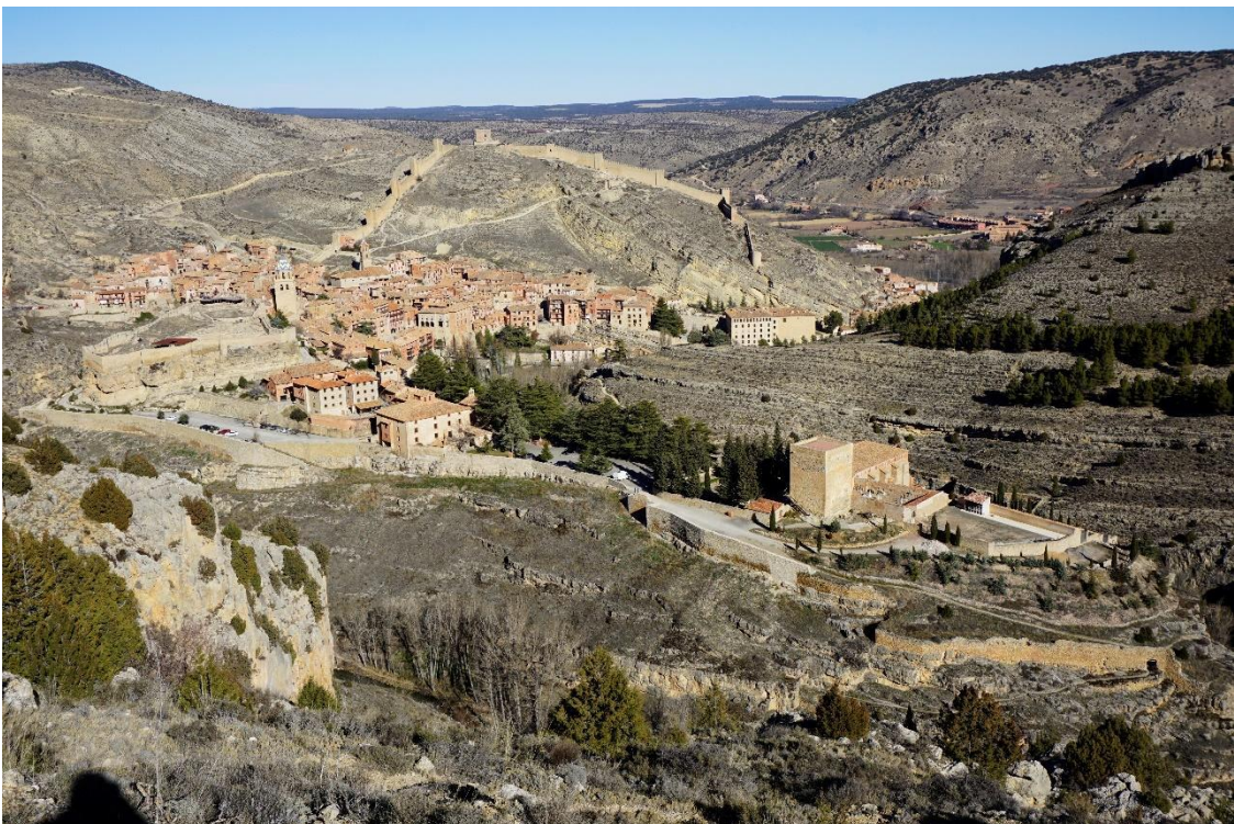
Figure 2. Image of the walled enclosure of Albarracín in 2019, before the restoration of the southern wall.