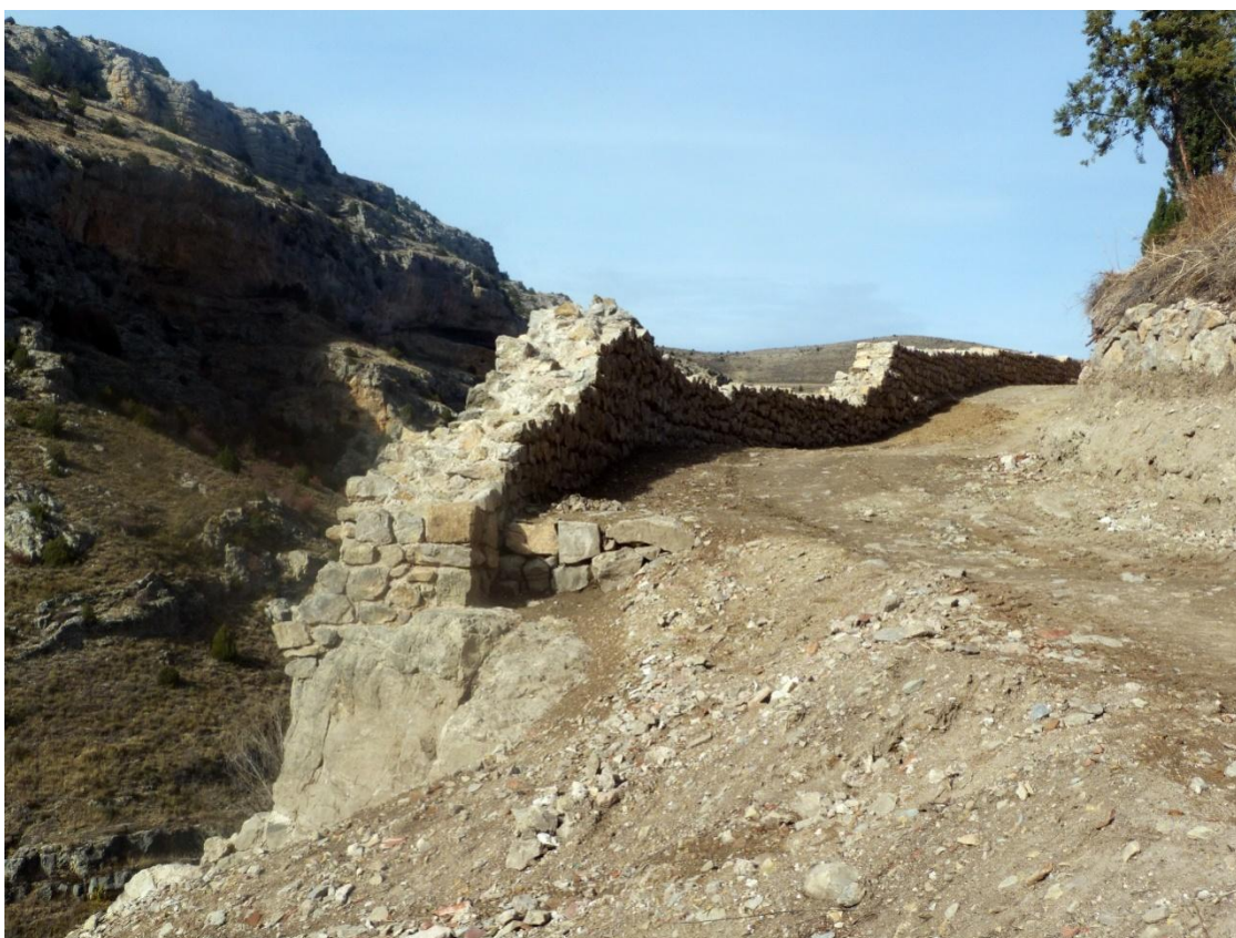
Figure 6. Recovery of the intrados of the wall section intervened in the first phase (2020)