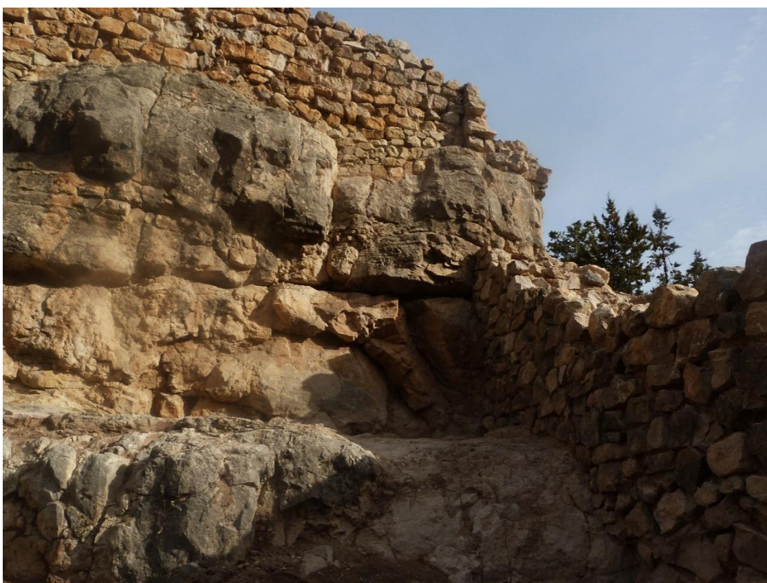
Figure 8. Recovery of the extrados of the wall section intervened in the first phase (2020)