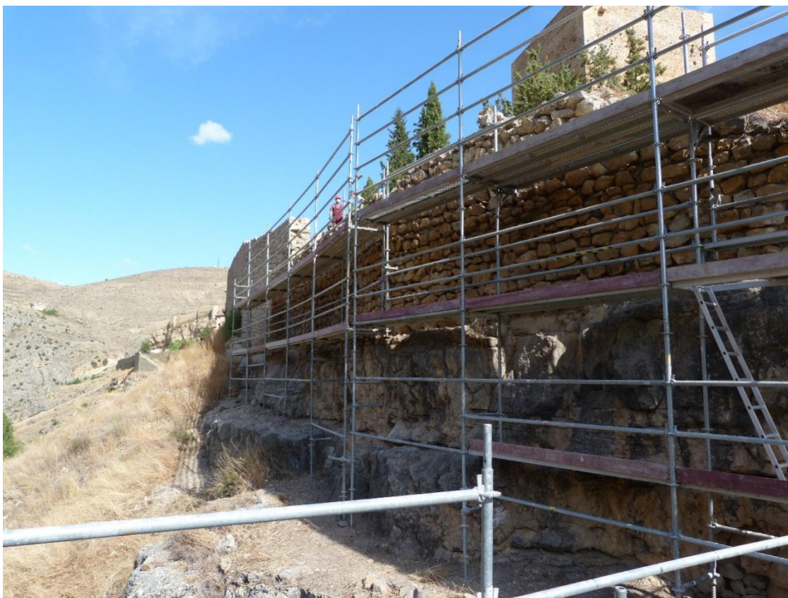
Figure 4. First restoration work on the south