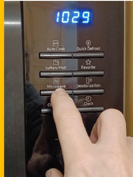
Operating a microwave oven