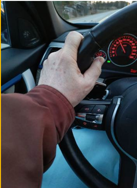
Rotating the steering wheel of a vehicle