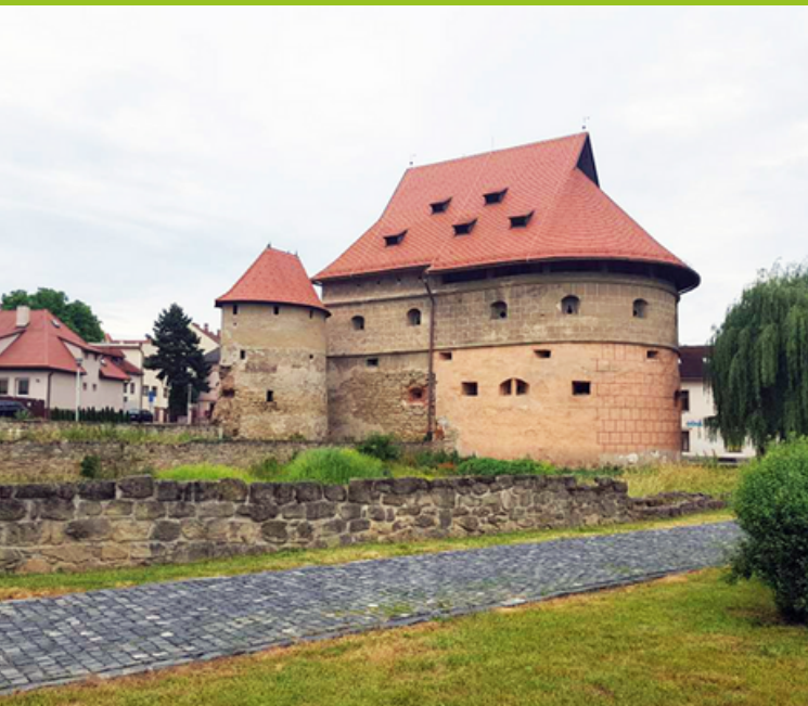
Bastion - City of Bardejov, Slovakia