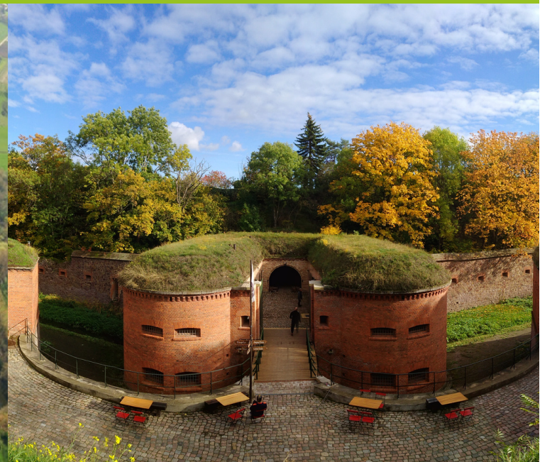
Ravelin 2, Magdeburg, Germany