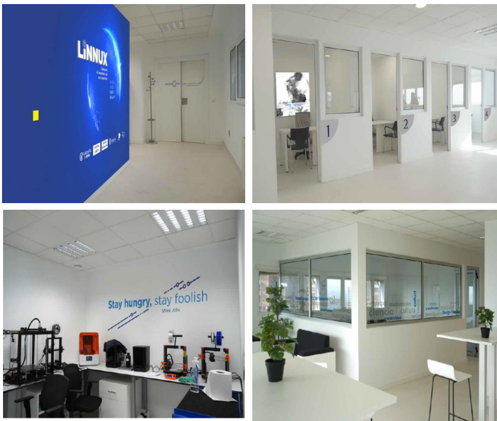
Pictures of some examples of the facilities of the Linnux-E: Main entrance, offices, prototyping lab and creativity space.

It has also been equipped as a service element and bathroom and a waiting-room; the latter located at the entrance of the building.