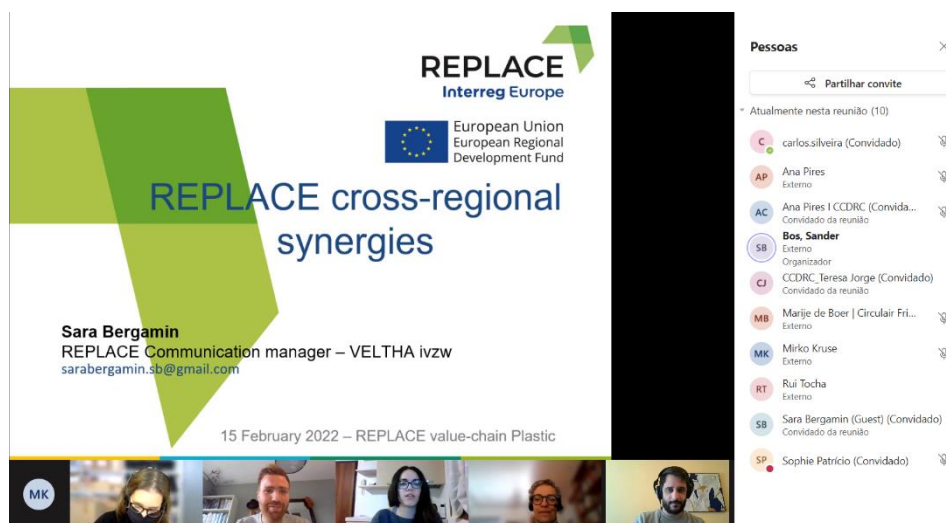
Figure 1 – Presentation on the REPLACE project and approach