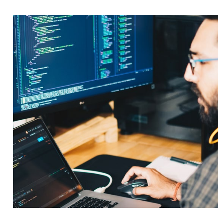
Figure 2 The untapped potential of foreign talent in Lithuania

Lithuania's migration policy is favourable to international workers, however, it is not yet focused on the high-tech sectors, which Lithuania intends to promote. According to the International Monetary Fund, Lithuania has reached a relatively high level of development. It ranked 15th among the EU Member States in 2020 according to the GDP per capita based on purchasing power parity. Therefore, Lithuania is capable of creating a great value proposition to international talents and demonstrating much higher results of talent attraction.