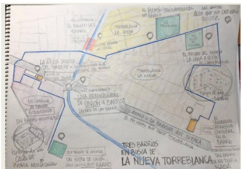
Propuesta de clase del PASEO MAPEO DE TORREBLANCA