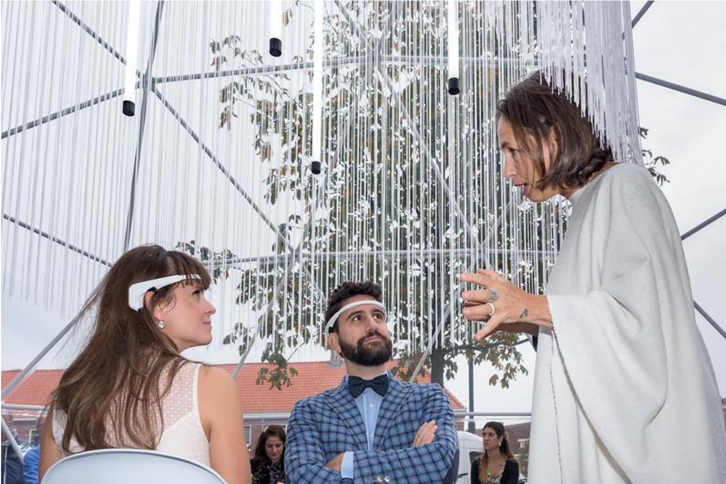
brainwave wedding, lancel|maat and baltan laboratories. dutch design week 2019