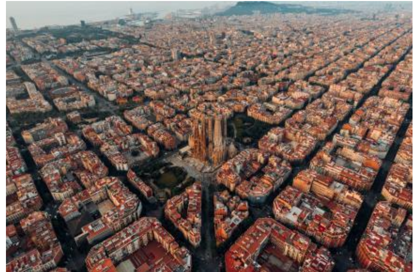
CC0 Logan Armstrong