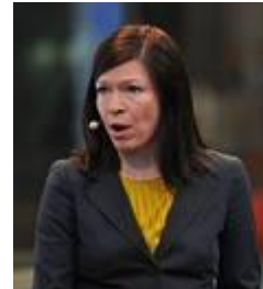
Anni SINNEMÄKI Deputy Mayor of the City of Helsinki