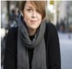
Katrin STJERNFELDT JAMMEH Mayor of the City of Malmö