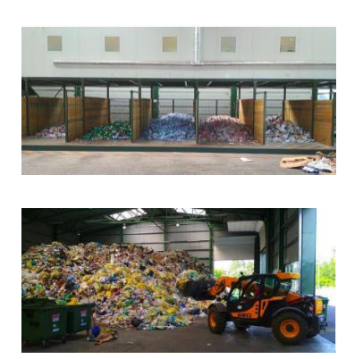
Collection of biowaste and unsorted household waste in Sigulda, starting of the project 2021

In addition, during the second day, the Expert Task Force (ETF) and Steering Group meetings took place setting the work plan and the deadlines of the upcoming activities.