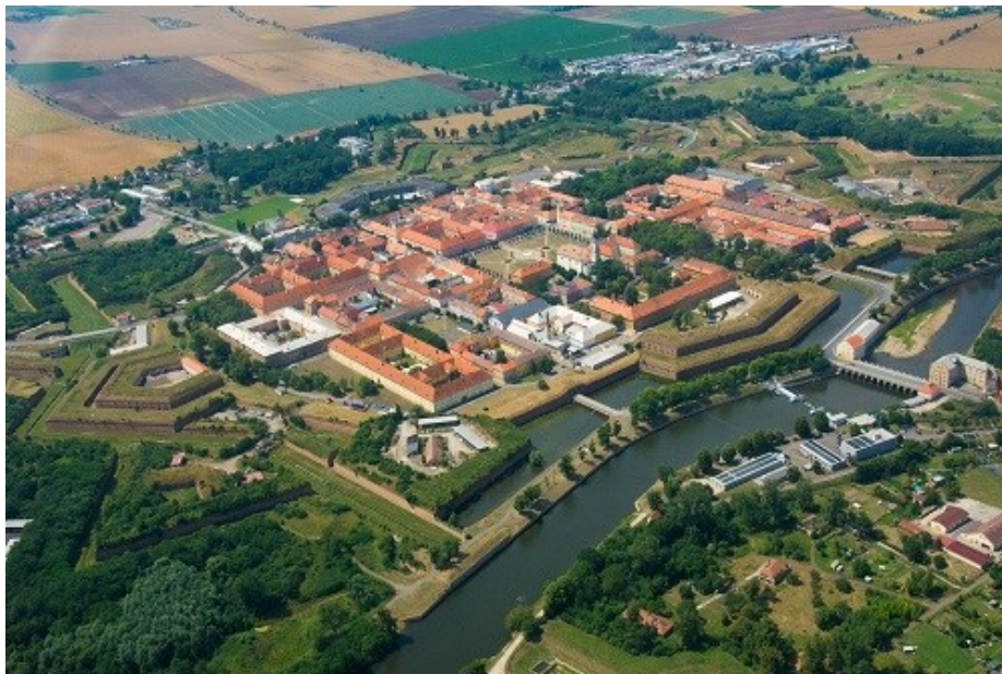
The fortress Terezin now