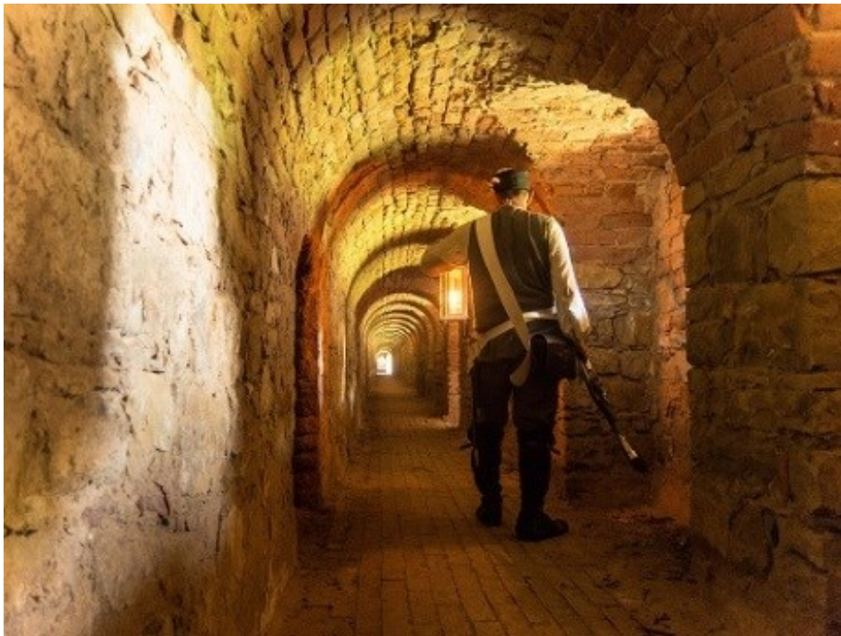
Underground mine corridors of the fortress Terezin now