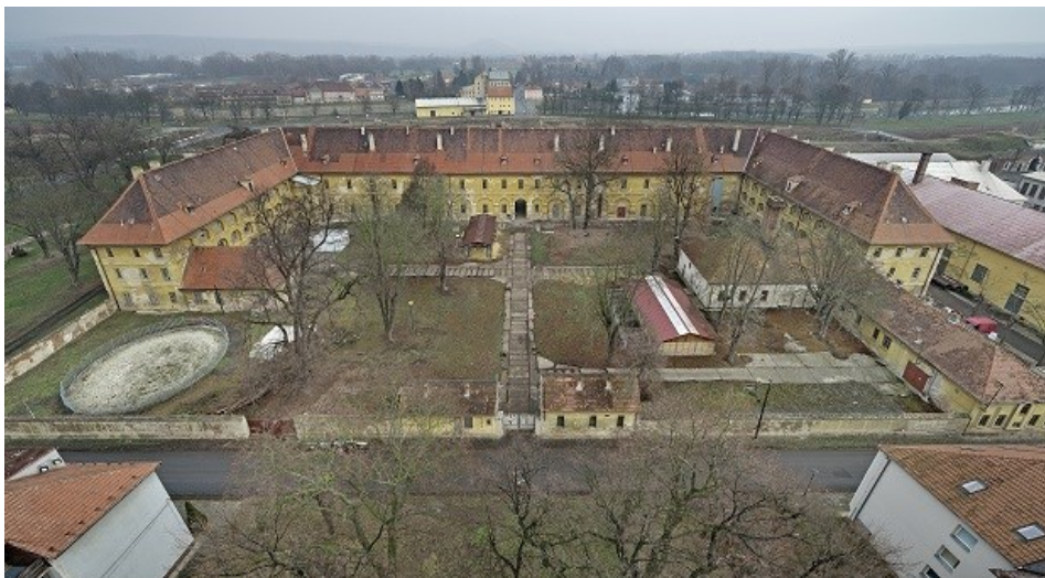
Garrison Hospital in Terezin, photo: Ivan Němec, 2019