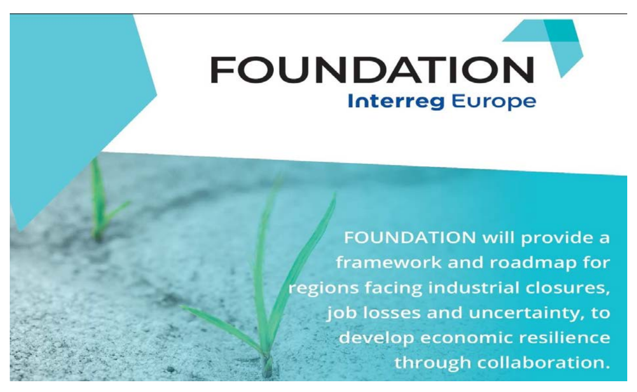
COVID-19 SPECIAL NEWSLETTER 1 - 02/04/2020