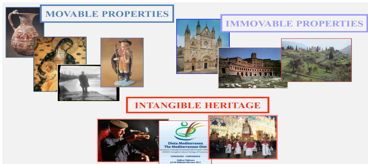
Fig.2 The three macro-categories of the catalogue sheets

The catalogue sheets are organized in three macro-categories: movable properties, immovable properties and intangible heritage.